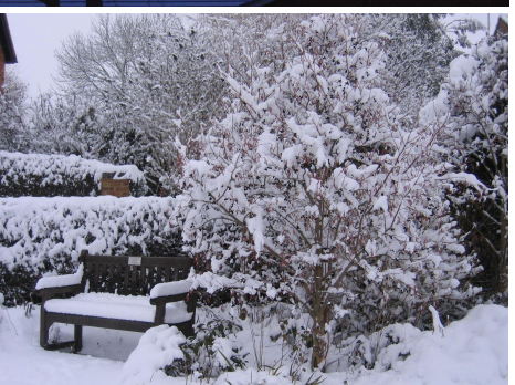
Garden in the snow January 2010