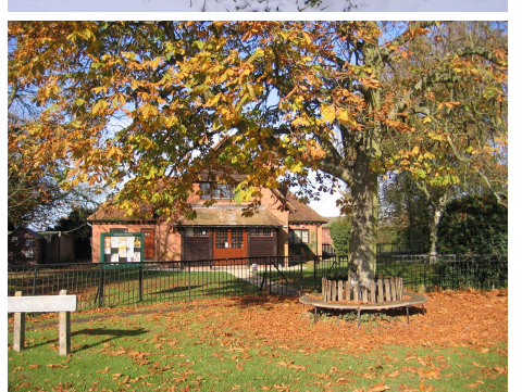
Village Hall