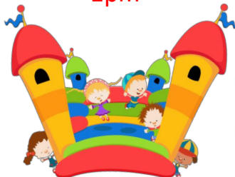
Free bouncy castle