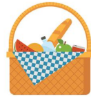
Bring a picnic

Inviting all to come & join in the fun at the