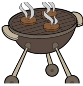
Enjoy the BBQ