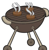
Enjoy the BBQ