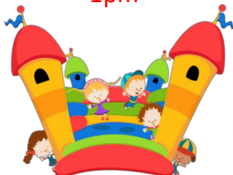
Free bouncy castle